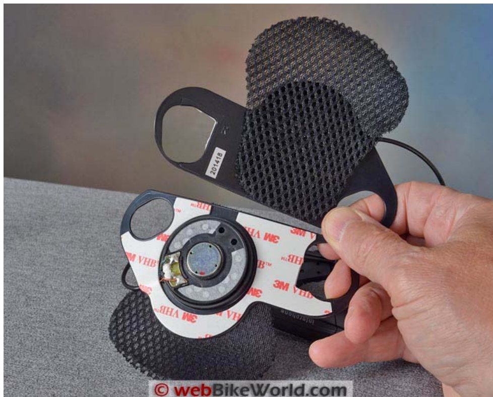
The Interphone Pro Sound audio kit for Shoei helmets includes the Shoei mesh ear pocket lining.