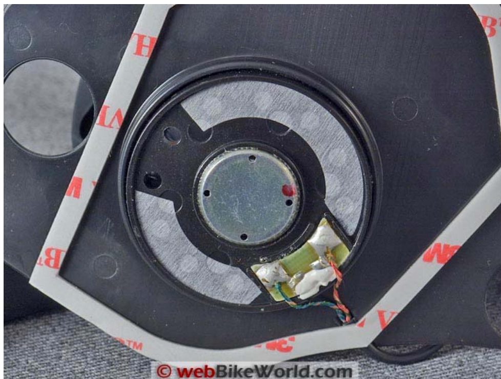
Rear view of a Pro Sound speaker.