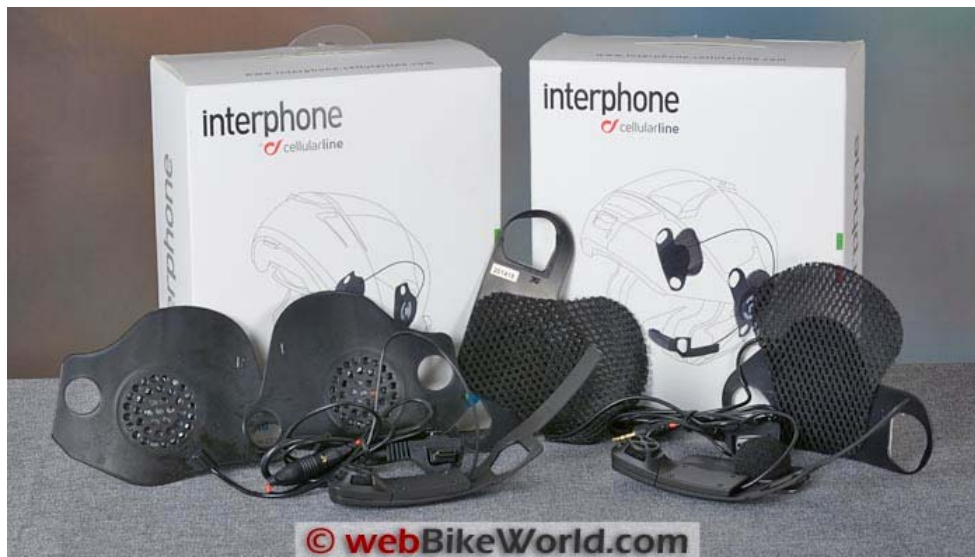
Interphone Pro Sound kit for the Schuberth C3 and C3 Pro (L) and for Shoei helmets (R).