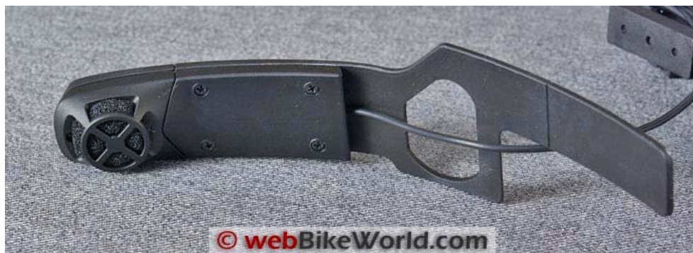
Interphone Pro Sound audio kit boom mic, business side.