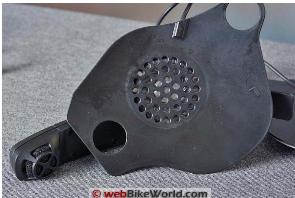
Close-up of the business side of a Schubert Pro Sound speaker.