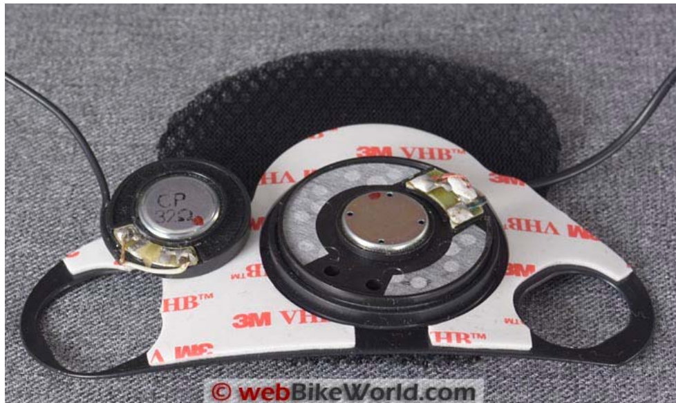
Interphone F5MC standard speaker (L) compared to the Pro Sound speaker size.

The Pro Sound molded sections are smooth and comfortable and make you wonder why all intercom speakers don't have something similar.