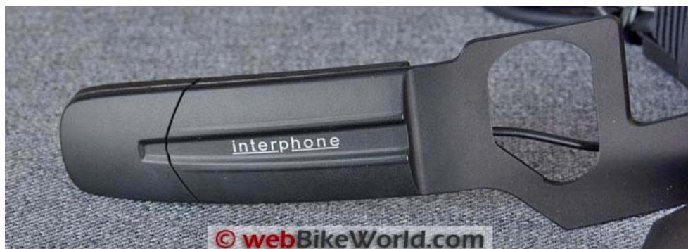
Interphone Pro Sound audio kit boom mic.

There's not much to the installation and the Pro Sound kit for Shoei helmets even includes the nice Shoei-style mesh liner over the inside of the speaker molding so that everything looks original.