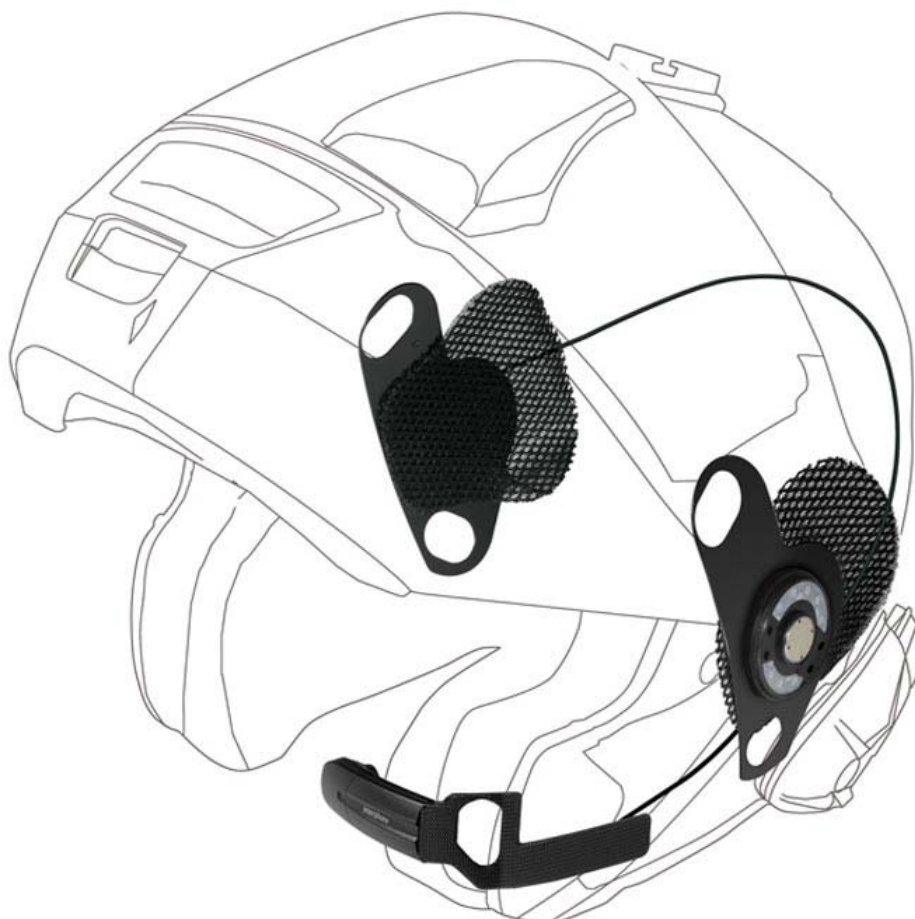
Interphone Pro Sound audio kit cutaway as fitted to a Shoei Neotec.

In fact, this is one of the biggest problems with basic motorcycle intercom speaker systems. It's very difficult to ideally locate the speakers inside a helmet, which then results in owner complaints for low volume and poor bass response. I'm guessing that if the kit becomes popular, Interphone will make versions for more premium helmet makes and models.