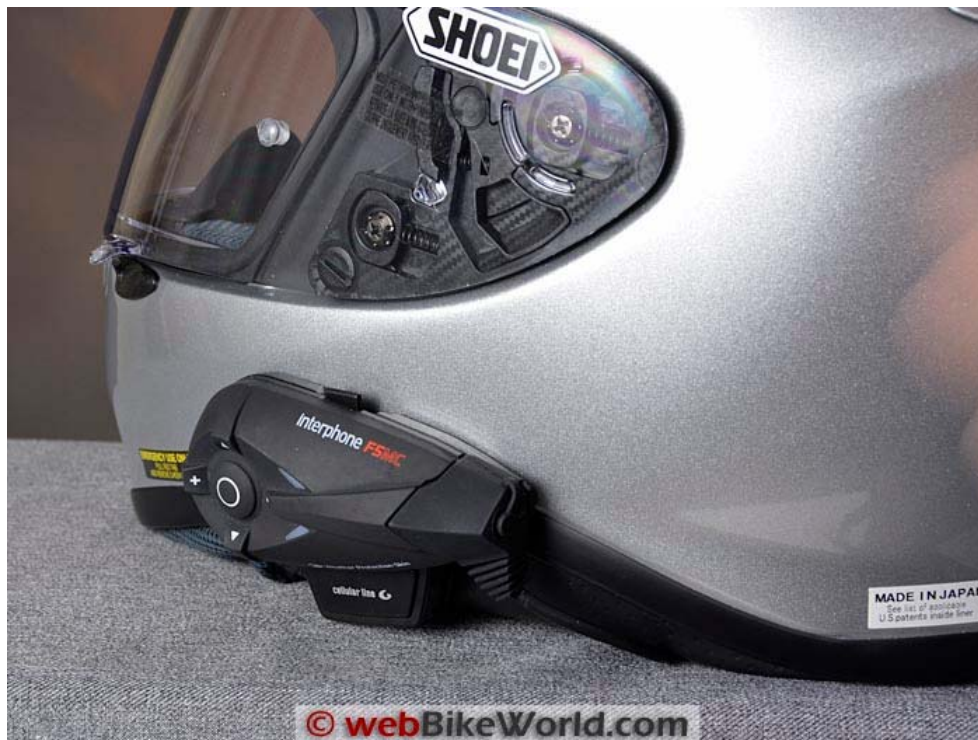
The Interphone F5MC intercom fitted to a Shoei helmet.