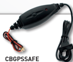
CBGPSSAFE 12V battery charger for GPSSAFE fixed installation

GPS SAFE can be recharged by using a permanent power supply system not included in the package. Contact an authorised retailer for further information.