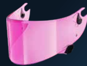
PINK NEW APPROVED DAY USE ONLY VZ10031PPNKU