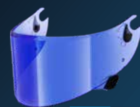
BLUE NEW RACING USE ONLY VZ10022P BLU