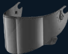
DARK SMOKE RACING USE ONLY VZ10022P FU

ADD A TOUCH OF INDIVIDUALITY TO YOUR GEAR, FOR UNCOMPROMISING PERFORMANCE.