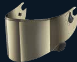
GOLD RACING USE ONLY VZ10031P GLD