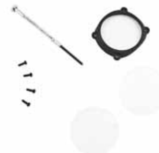
GHOST-S REPLACEMENT LENS KIT

Ensures you never miss a shot due to a broken lens. Includes 2 x replacement lenses and all the parts and tools you need to change the lens of your Drift Ghost-S