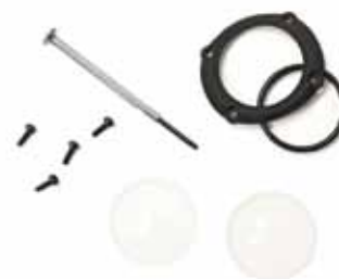
HD GHOST REPLACEMENT LENS KIT

Ensures you never miss a shot due to a broken lens. Includes 2 x replacement lenses and all the parts and tools you need to change the lens of your Drift HD Ghost.