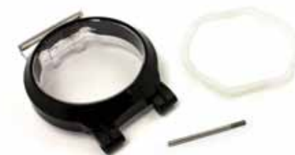
WATERPROOF CASE REPLACEMENT LENS KIT

Keep the underwater clarity of the Drift HD Ghost or Ghost-S, even if you damage your waterproof case's lens cover.