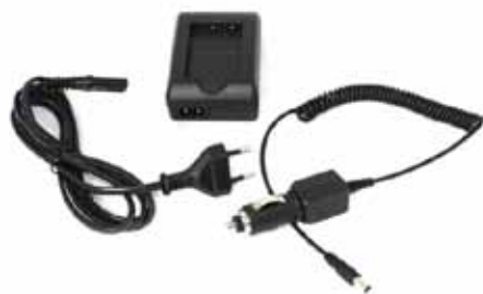
GHOST CRADLE CHARGER

Compatible with the Drift HD Ghost or Ghost-S battery. Input Voltage 100-240V (AC) at 50/60Hz, 0.2A. Also comes with 12v adaptor for in-vehicle charging.