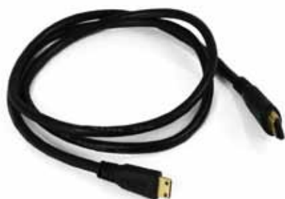
MINI HDMI CABLE

Athlete: Justine Mauvin