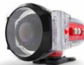
GHOST WATERPROOF CASE

Allows you to take the Drift HD Ghost or Ghost-S down to depths of 60m (196ft) - Perfect for diving, surfing or any underwater filming. The case also offers extra protection against knocks and scrapes and features a standard 1/4" 20 thread, compatible with the universal clip as well as a wide range of additional mounts.