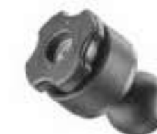
SMQUIKLOXRAMADAPT RAM MOUNT ADAPTER