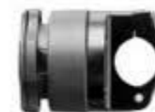
SMQUIKLOXMIRROR SMALL TUBE/ MIRROR MOUNT