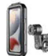
SMQUIKLOXARMORPRO WATERPROOF HARDCASE