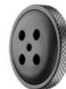
SMQUIKLOXANTIVIB ANTIVIBRATION DAMPNER