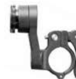
SMQUIKLOX HANDLEBAR MOUNT