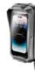
SMQUIKLOXWP WATERPROOF SOFTCASE

The ARMOR PRO, on the other hand, includes the SMQUIKLOXHANDLEBAR handlebar mount equipped with quick fit/release system inside the package.