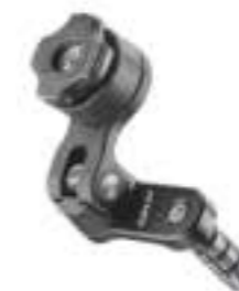
SMQIKLOXFORKSTEM FORK STEM MOUNT

Quiklox mount designed for motorcycles that require mounting in the tube of the fork stem.