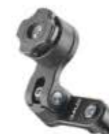
SMQUIKLOXBARCLAMP BAR CLAMP MOUNT