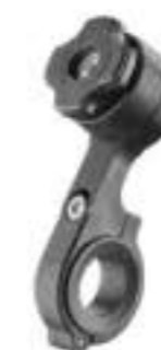
SMQUIKLOXBIKEMOUNT BICYCLE HANDLEBAR STANDARD MOUNT