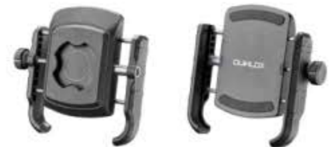
SMQUIKLOXCRAB QUIKLOX CRAB SMARTPHONE HOLDER