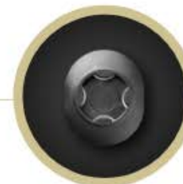
Universal Adhesive Pad