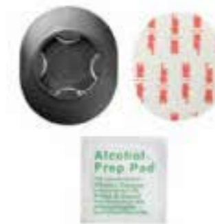
SMQUIKLOXPAD ADHESIVE PAD

The 3M adhesive guarantees maximum grip and stability.