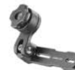
SMQIKLOXBRKMOUNT BRAKE MOUNT